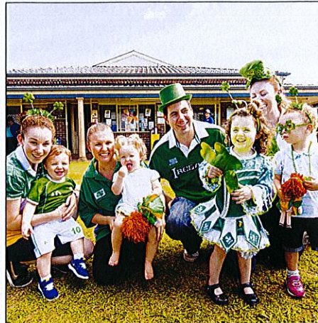
Staff and children from Gracelands Early Education Centre in Kellyville get into the Irish spirit for St Patrick's Day.